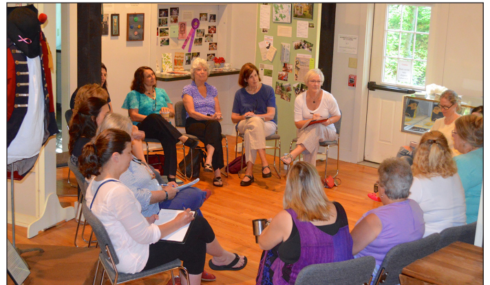
Chester Museum at The Mill is occasionally available for outside use also as we provided the site for two library-sponsored events in the winter. Above, members of the Chester Merchants Group assembled for their monthly meeting on the first floor.