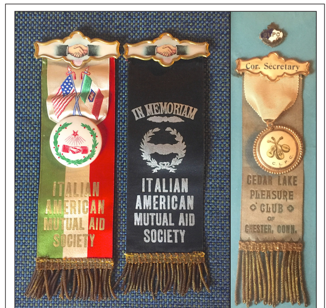
Two ribbons from the Italian American Mutual Aid Society and one from the Cedar Lake Pleasure Club. To learn more of these community groups and their members, visit the 2016 exhibit at Chester Museum at The Mill.

Article two of the society's by-laws outlined the purpose: "...solidarity, the need of the members to unite themselves, the liberty, brotherhood and equality, the mutual benefit, the instruction, the morality, and the welfare of its members."